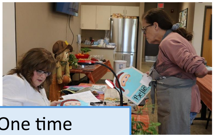
One on One time