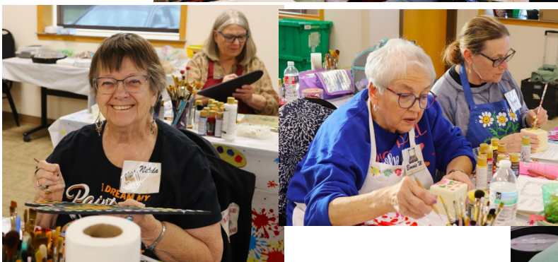
Everyone had a great time!