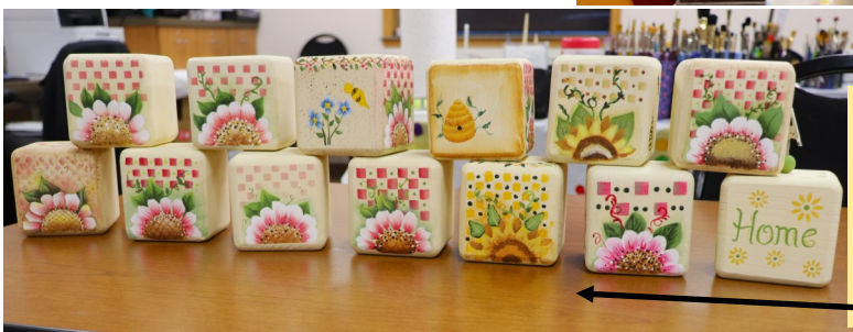
Karol taught These cute Recipe/Pics Holder.