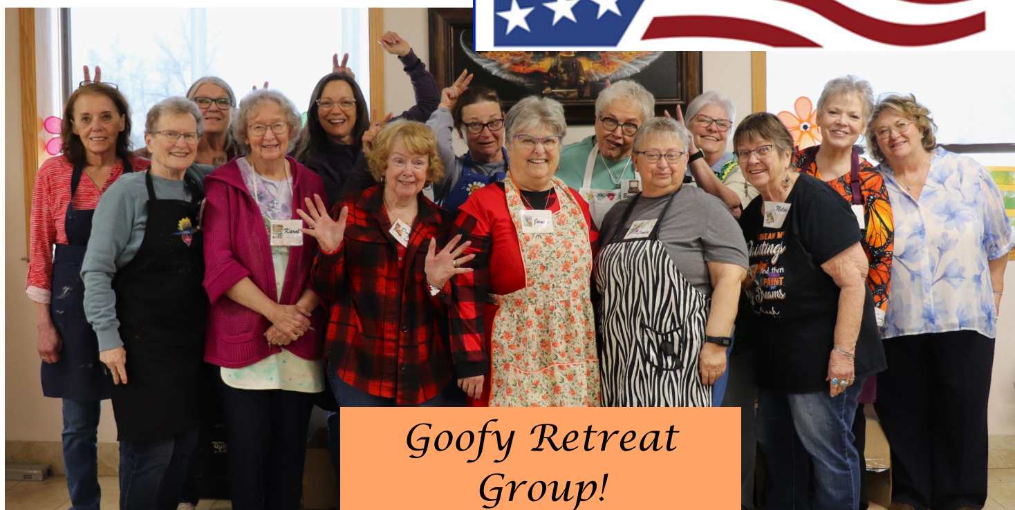
Goofy Retreat Group!